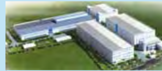
Donghua's Annual Sales & Marketing Conference was held in October at Group Headquarters, China.