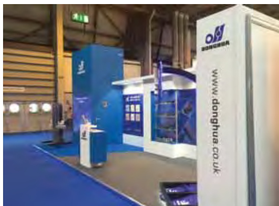
When it came to Chain, the Donghua Team were No.1 at IMHX 2016. Literally.

He won a GoPro HERO4 Silver Camera & accessories.