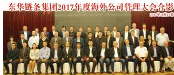
东华链条集团2017年度海外公司管理大会合影 During the four days, colleagues from across the globe reviewed sales & marketing, held technical meetings and took part in tours of the factories.

We have plans for a new product launch that you won't want to miss, so make a note of the date and our Stand No. EP210 and join us at the show.